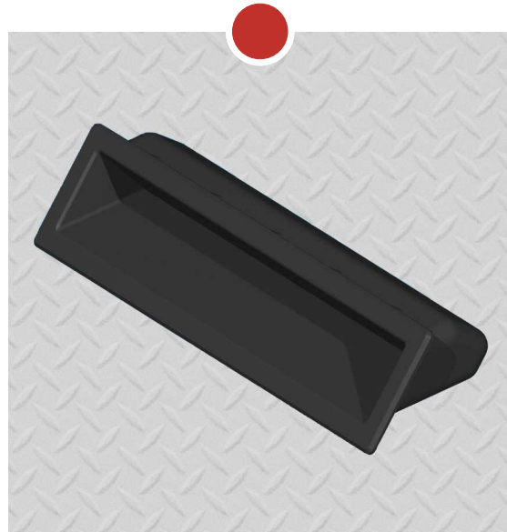
Clip-in handle 19-7-3826 (deep)