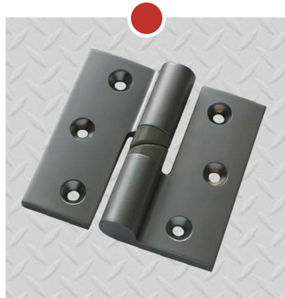
Lift-off rising butt hinge RH 14-1-3797

Other hinges for swimming pool & commercial furniture: see our catalogue.