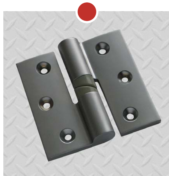
Lift-off rising butt hinge LH 14-1-3798